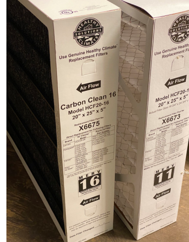
Healthy Climate Carbon Clean 16® Media provides an extra layer of filtration for your home.

shoes and, upon request, gloves and masks. They'll listen to your concerns about Covid-19 and respond practically. Please note: So as to reduce trips and service calls, if you have other needs or scheduled maintenance, please share that with our dispatch/customer care representatives and they can map out an efficient response. Technicians might be there to install a PureAir system, but if your HVAC