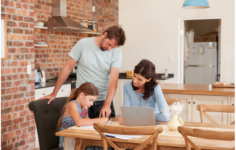
While under quarantine, you'll be spending more time inside your home, making the air quality more important than ever.

components. The Merv 16 precision pleat media filter offers impeccable air quality in your home.